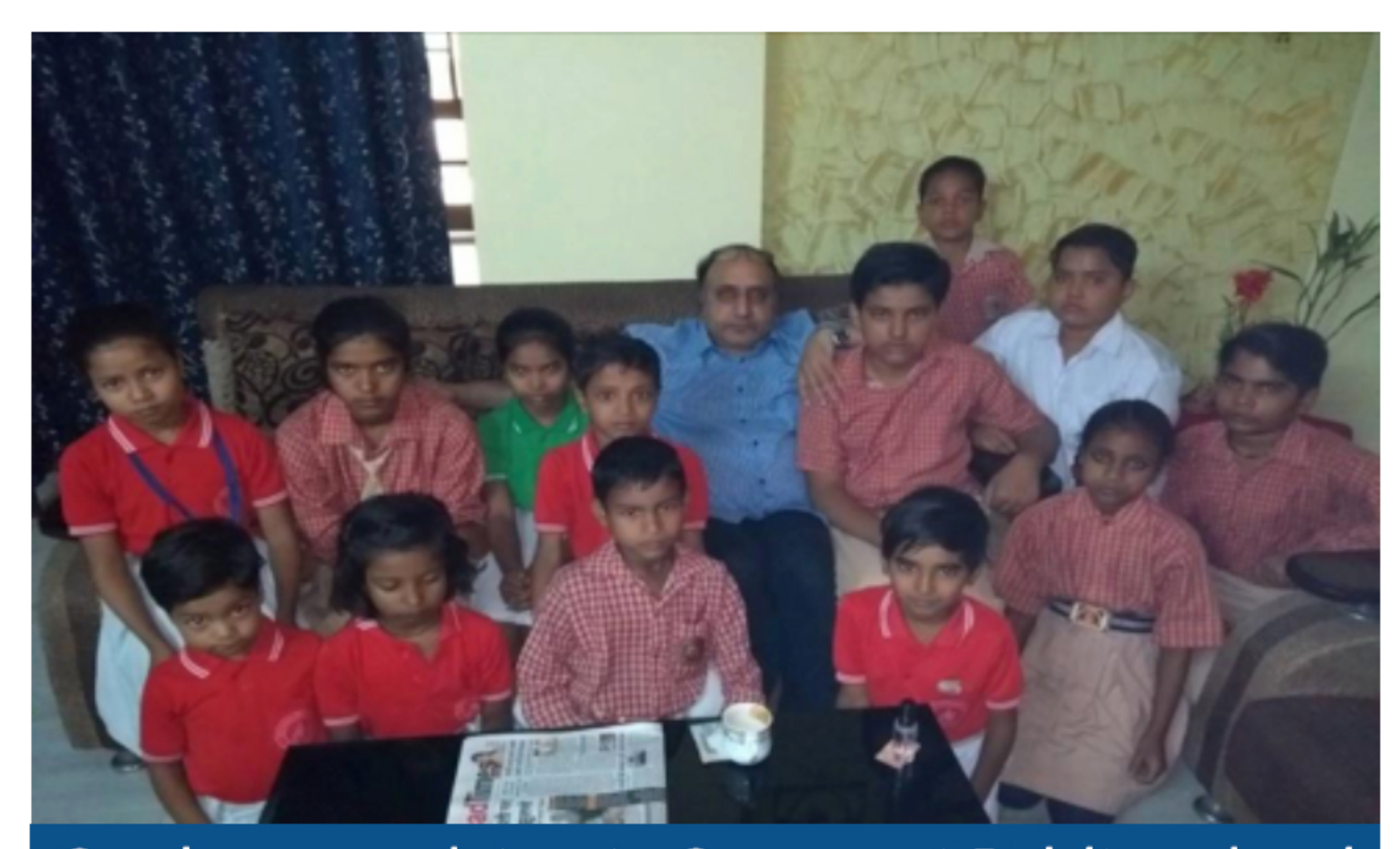
Students studying in Saraswati Public school Ghaziabad